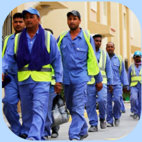
BLUE COLLAR EMPLOYMENT