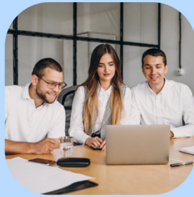
WHITE COLLAR EMPLOYMENT